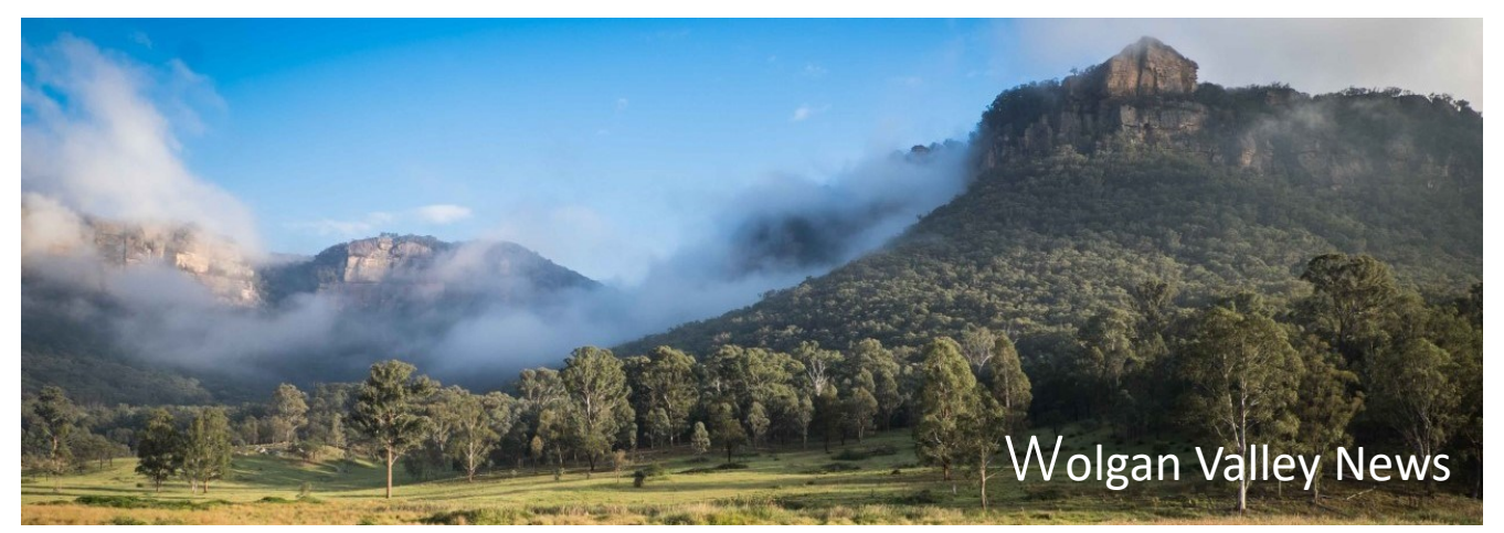
The newsletter of the Wolgan Valley Association Inc.